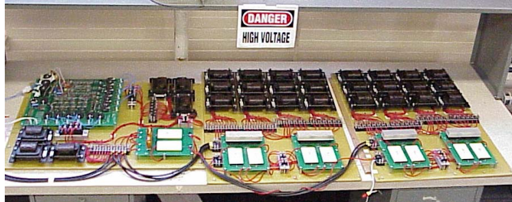
Figure 1. ACBPS Breadboard

Breadboard Most Viable Approach: At this point, the project effort was focused on implementing the ACBPS concept. The ACBPS, as shown in Figure 1, which consisted of 4 uncontrolled power stages combined with a single controlled stage, was built. Testing of the design successfully demonstrated the conversion of three phase 2 kHz to 6500VDC at an efficiency of 95% including the necessary front-end SCR AC line fault circuit.